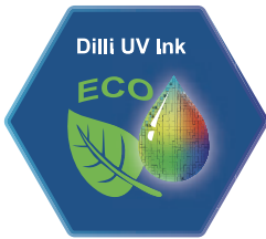
Dilli UV ink for high-end NEO EARTH Series

Speical Feature : Hybrid Printing System : Flexible and Rigid media printing | UV LED Curing System (Various of heat - sensitive materials available) | Print head Collision Prevention System | DAWC(Ink circulation system for whitehead protection) | Multi Layer Printing Mode (C+W , C+W+C , C+C+W+C etc./Max 5 layer printing available) | Enhancement of Space Utilization (Compact size with Built-in Extension Table)