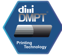
The extreme highest printing quality output achievable by banding free and conditioning free.