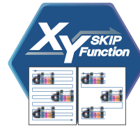
The printhead prints only where there is an image by skipping the blank space saving work time.